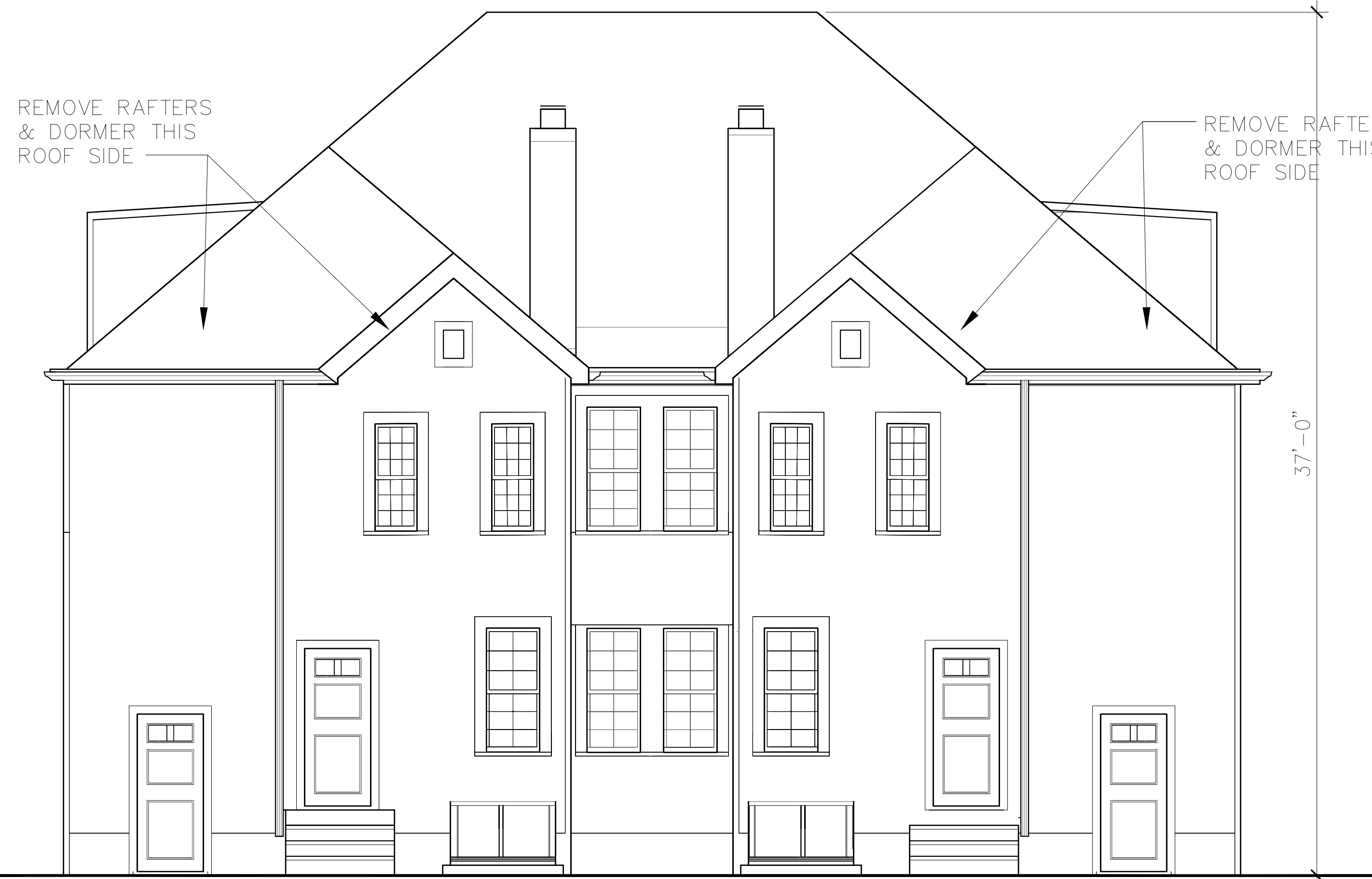
1 A1 EXISTING REAR ELEVATION 1/4"=1'-0"