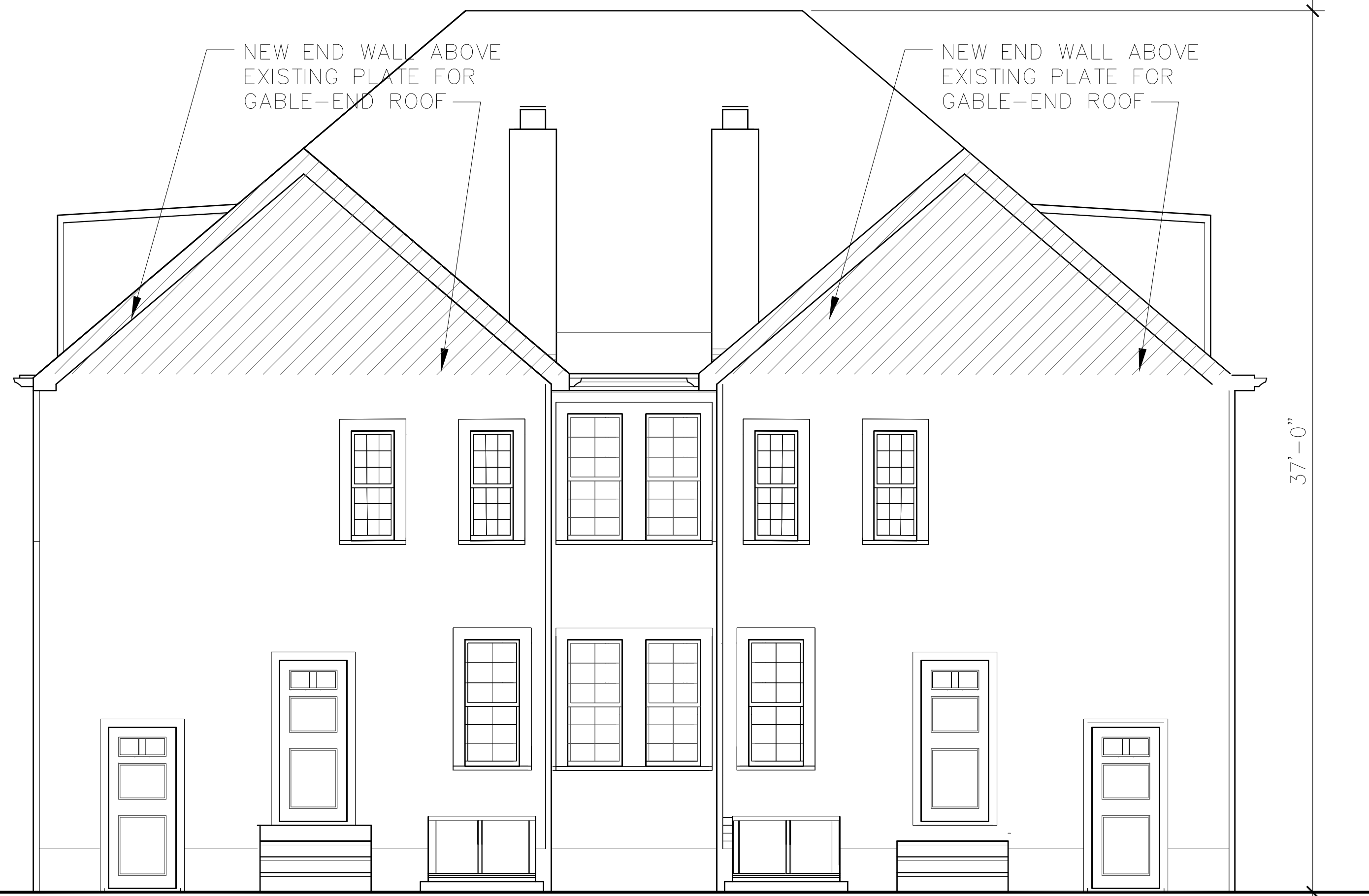
3 A1 PROPOSED REAR ELEVATION 1/4"=1'-0"