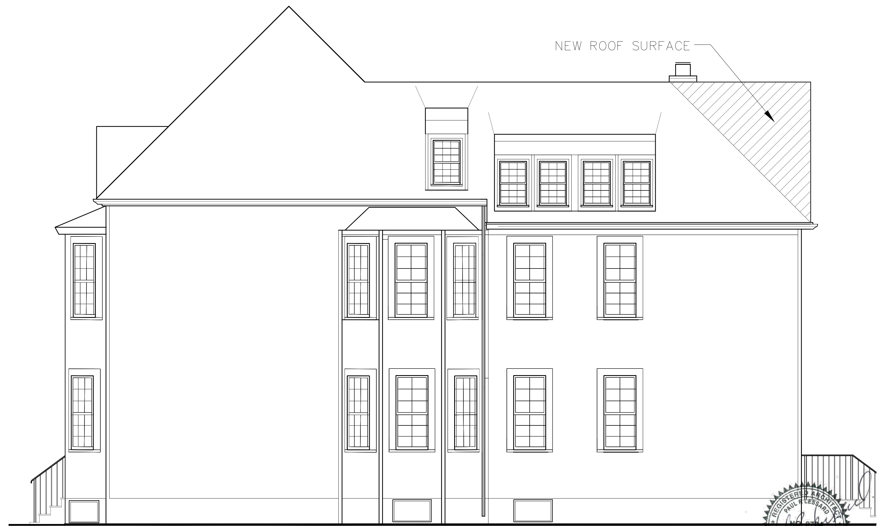
4 A1 PROPOSED SIDE ELEVATION 1/4"=1'-0"

PAUL R. LESSARD • REGISTERED ARCHITECT • 18 LEAVITT STREET SALEM, MA 01970 paul@paulrarchitect.com (978) 210-1960